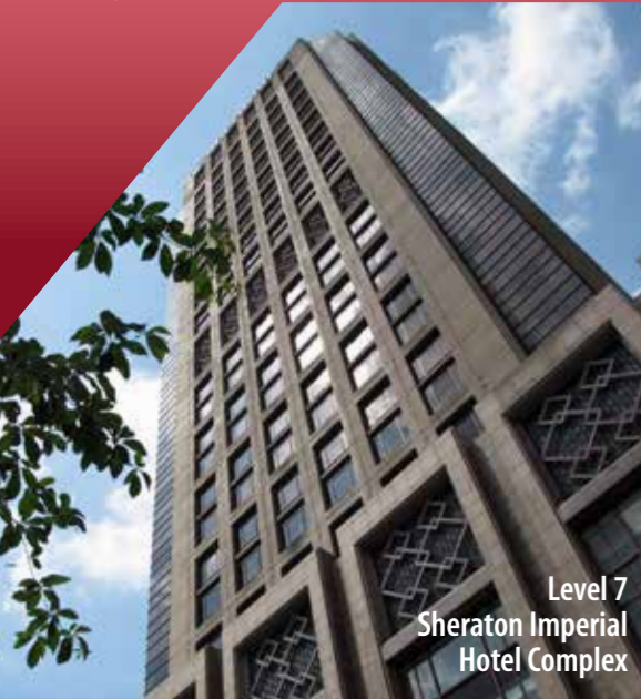
Level 7 Sheraton Imperial Hotel Complex