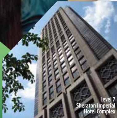
Level 7 Sheraton Imperial Hotel Complex

Graduate with an undergraduate degree and a professional body qualification or certification at a fraction of the cost of doing a full degree overseas.